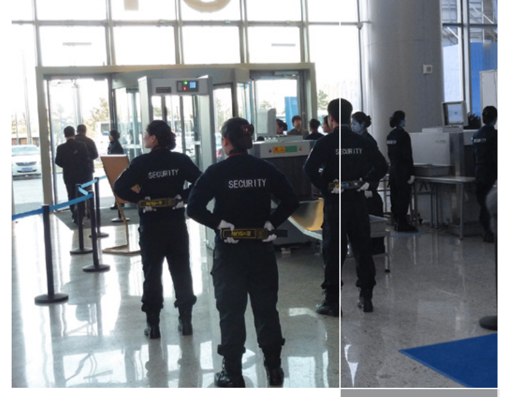
Convention Center in Beijing

unlawful physical restriction of the freedom of an individual (group of individuals), their release being made conditional on the demands of the relevant terrorist (terrorist group) being met;