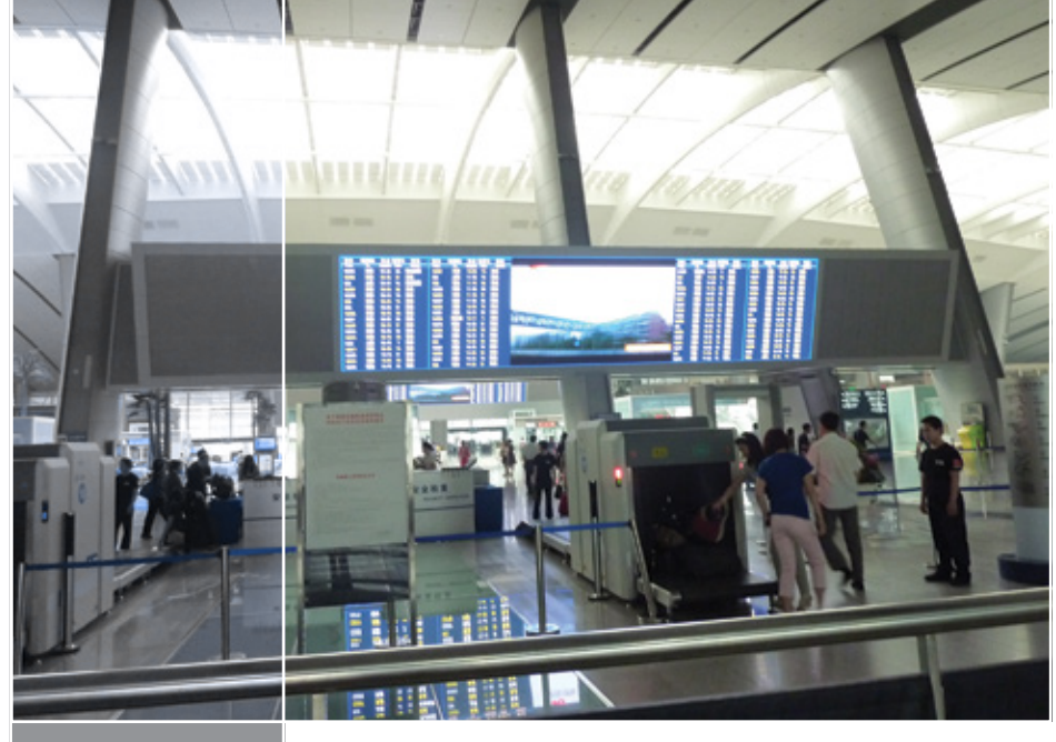
Beijing railway station