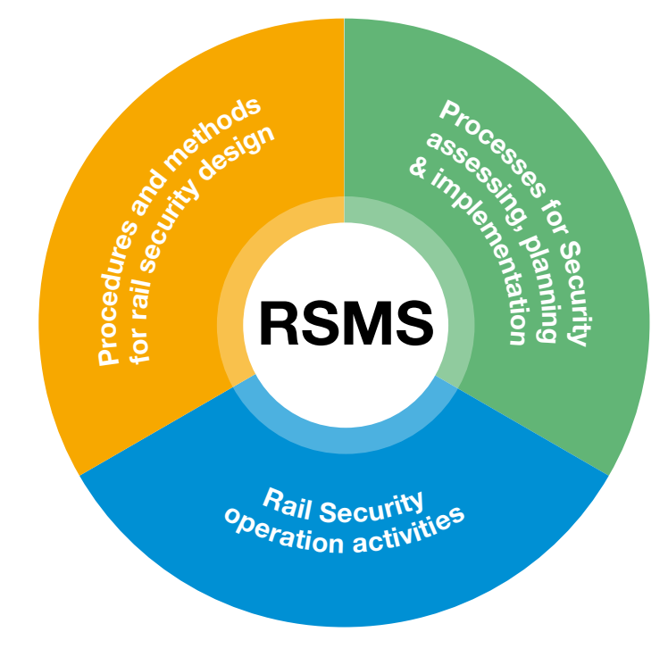
The Railway Security Management System wheel