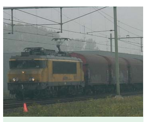
NOISE MEASUREMENTS IN SUSTEREN

International application of LL blocks should start 2009.■