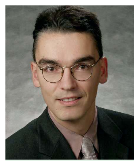
HEIKO KUNST, EUROPEAN UNION DG TREN

After the general discussion to prepare the Communication, the European Commission will continue to work together with member states and the rail freight industry towards a Europe-wide implementation of retrofitting of freight wagons. "Here, the focus should be on formalised European specifications for K and LL brake blocks", Kunst explains. "Once achieved, the legal framework for brake blocks will be the same as for any other safety relevant component used in the rail industry. The second major development should be a harmonised system of reducing track access charges.