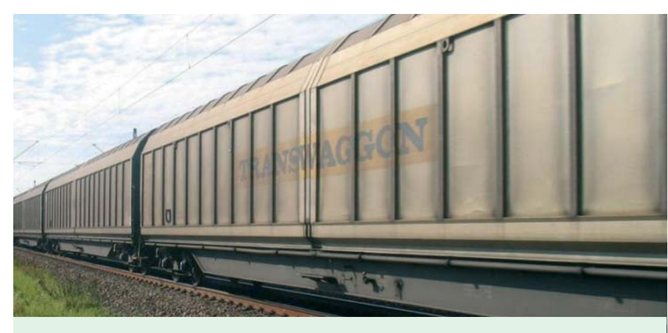
HBBINS WAGONS WITH K BLOCKS

Dutch city of Susteren. Organic K blocks and organic LL blocks showed a reduction of 11 to 14 decibels compared with cast iron blocks, whilst sintered LL blocks